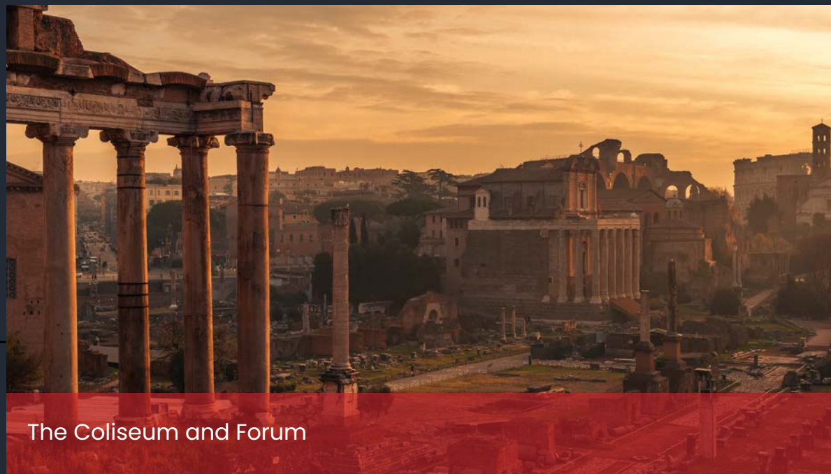
The Coliseum and Forum