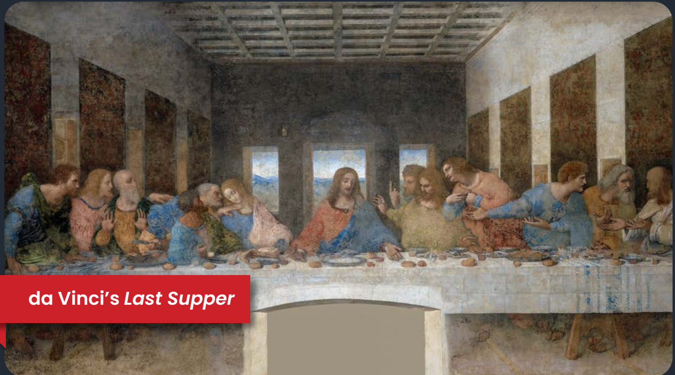
da Vinci's Last Supper

Our last full-day in Italy, we'll board our bus after breakfast and drive to Milan. Upon arrival, we'll check in at our hotel before setting out to see the city's "Must See" landmarks, including the architectural masterpiece Duomo, the stunning la Scalla opera house, and da Vinci's Last Supper painting.