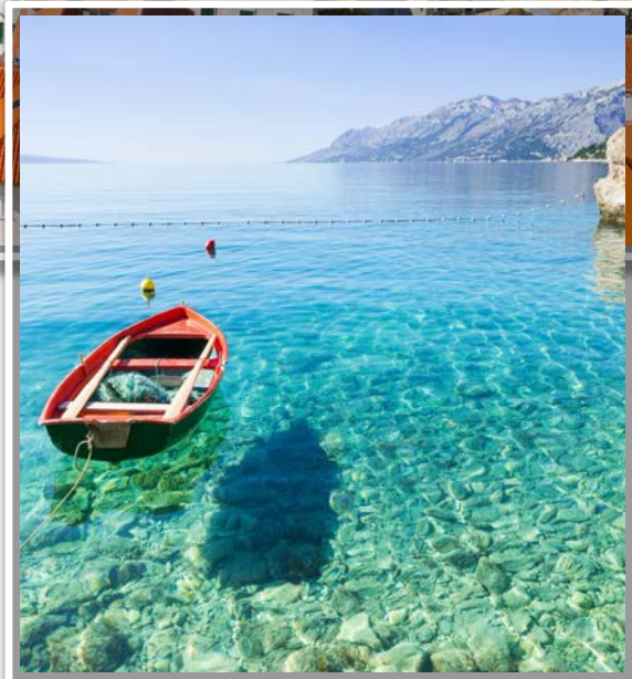
Overnight in Makarska

Our 7-day cruise will depart from Split and travel down the coast of Croatia, Along the route, the Captain will regularly moor in small, unspoiled bays to allow you the change to swim in the clear, calm waters of the Adriatic. Breakfasts and lunches are freshly prepared for you each day by the onboard chef. You have the evenings free to step ashore and visit one of the many waterside bars, cafes, and restaurants. Absorb the sights and smells of a balmy Croatian evening while enjoying a drink and local seafood cuisine.