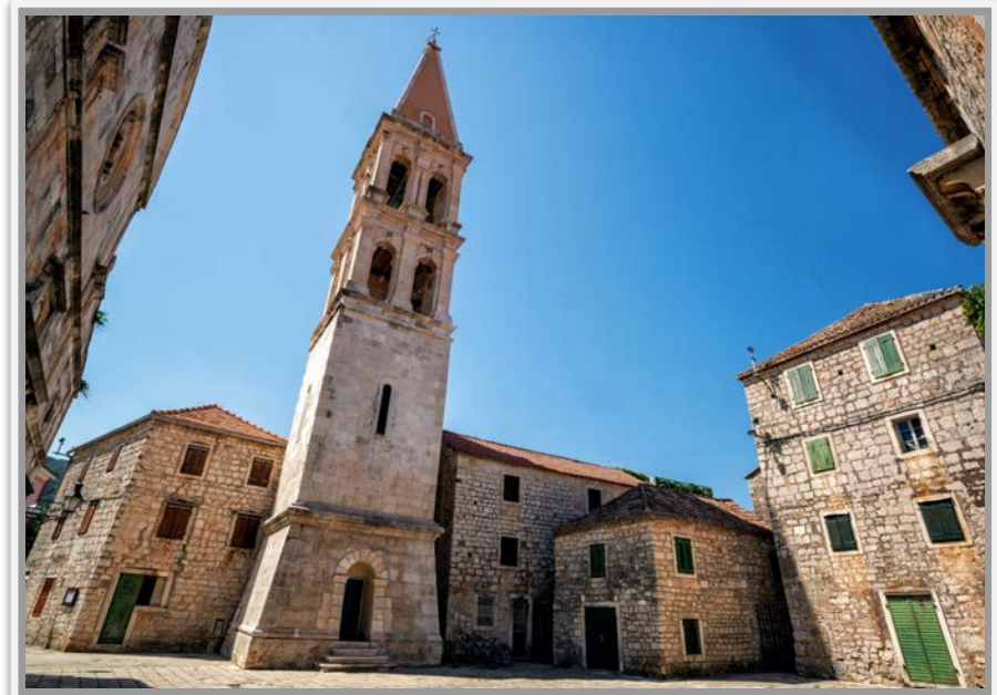
Overnight in Hvar