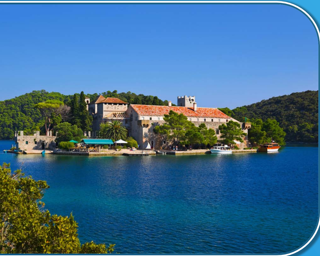
Overnight in port of Pomena